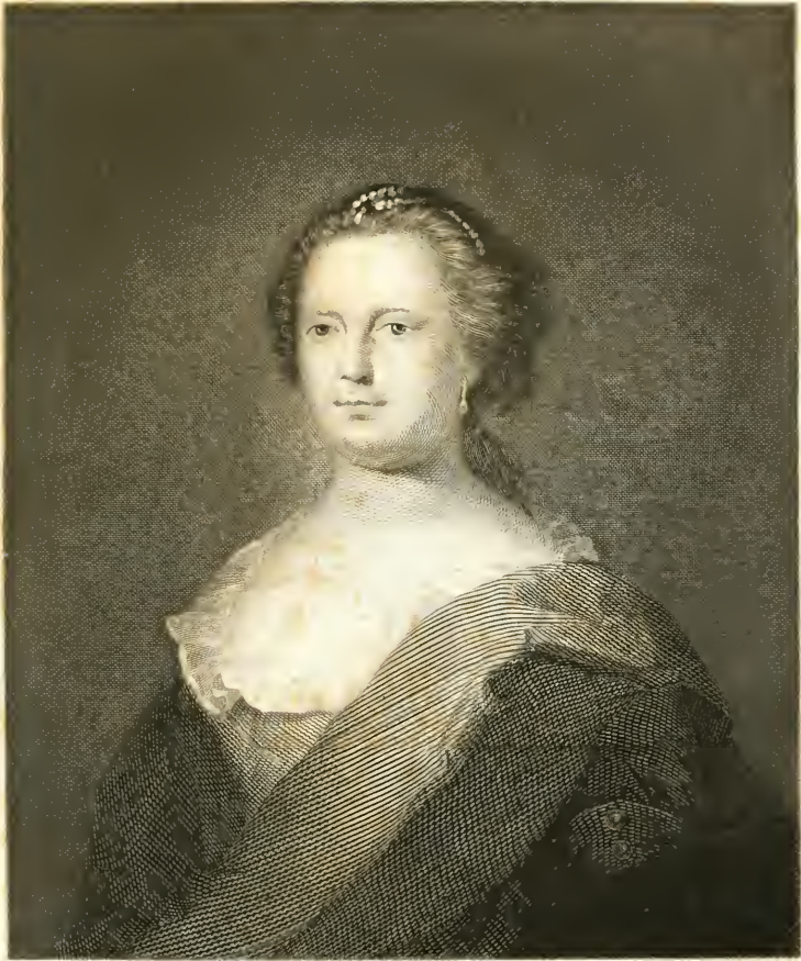
MISS [Name] IN THE POSSESSION OF [Name]